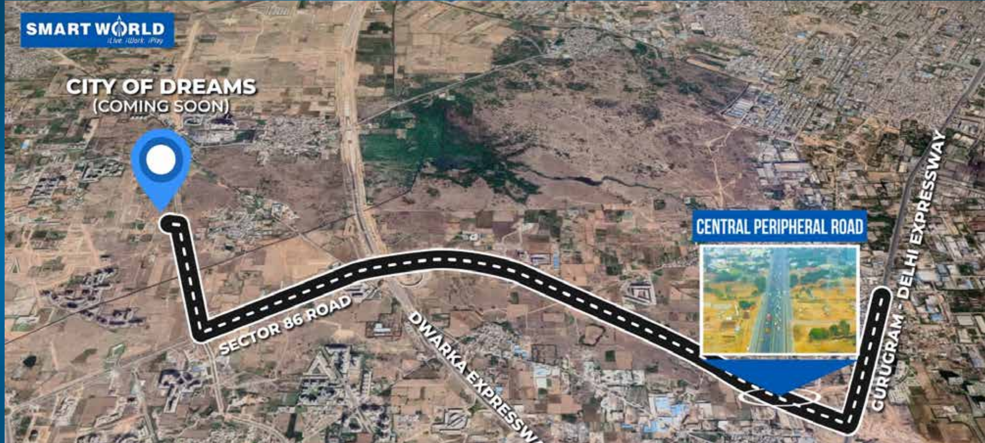
FROM CENTRAL PERIPHERAL ROAD