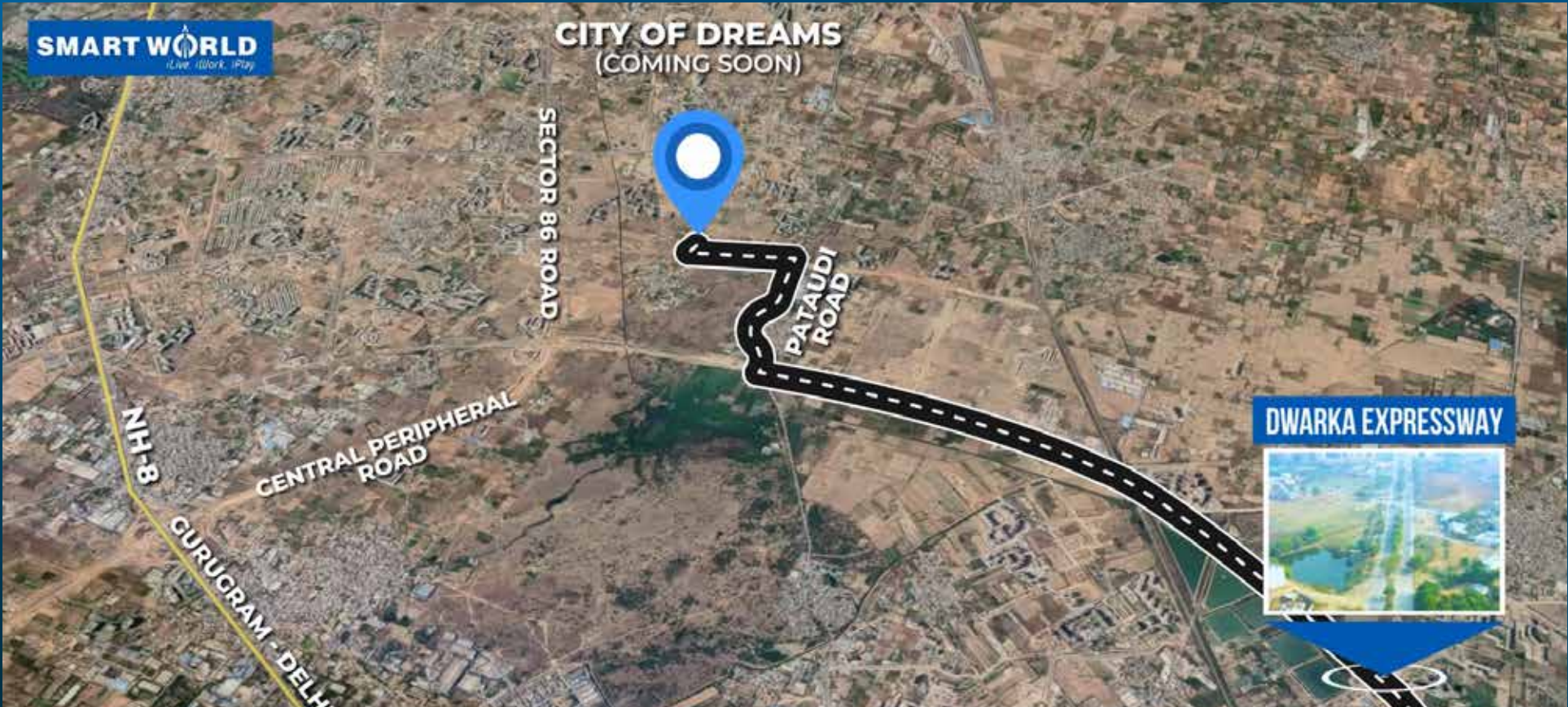
FROM DWARKA EXPRESSWAY